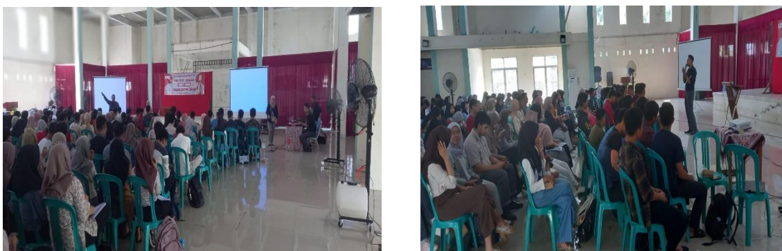
Figure 1. Socialization and Information Provision Activities

SNBT-UTBK, and SM. First, SNBP is an invitation route to replace the National Selection for State University Entrance (SNMPTN). Students who can take part in SNBP or are eligible students are students selected by the school based on academic and non-academic achievement assessments. It is estimated that SNBP registration can be done in February. Second, SNBT is a National Selection Based on Tests conducted via the Computer-Based Written Examination (UTBK). SNBT is a replacement for the Joint State University Entrance Selection (SBMPTN). The questions in this selection will focus on students' reasoning abilities and not memorization. It is estimated that SNBT registration can be done from March to April. In the 2024 SNBT-UTBK implementation, students will only face questions that focus on understanding and reasoning. There are two main components in the implementation of SNBT -UTBK, namely the Scholastic Potential Test and the Literacy Test. If added together, the total number of questions for the two components is 155 items and is divided into several subtests. Third, SM is an abbreviation for PTN Independent Selection. This route is intended for participants who have not been lucky in SNBP or SNBT. SM is expected to open from May to August depending on each PTN being targeted.